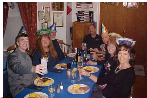
CYC New Year's Eve 2012

Additional pictures are posted on Facebook – Corinthian YachtClub – Photos