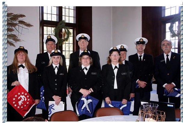
CYC Board 2012