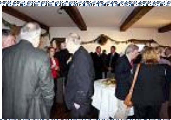
Old State House